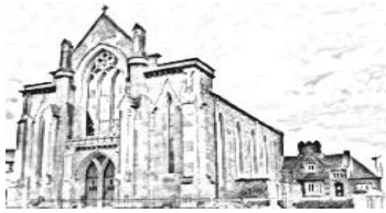
St. Mary's R. C. Church

120 Cadzow Street, Hamilton, ML3 6HP Tel: 01698 423552