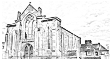
St. Mary's R. C. Church

120 Cadzow Street, Hamilton, ML3 6HP Tel: 01698 423552