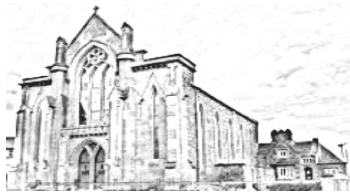
St. Mary's R. C. Church

120 Cadzow Street, Hamilton, ML3 6HP Tel: 01698 423552